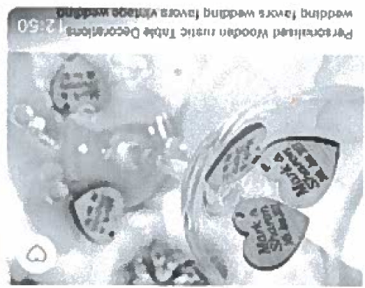
Made and sold by Laserluz2016