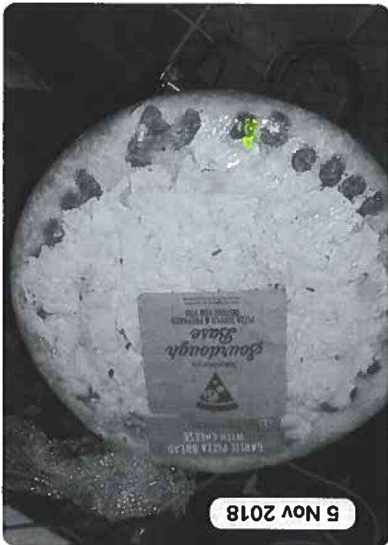
You want some x