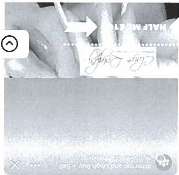
No think it's curtains x 11:00