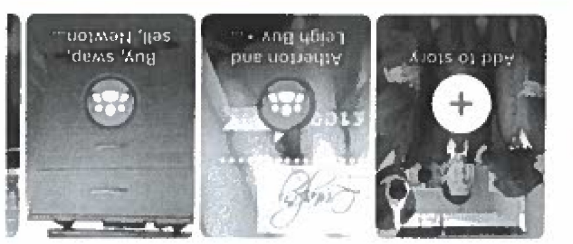
27 Sep 2018 Your archive