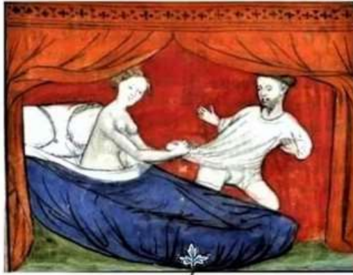
The Very Secret Sex Lives of Medieval Women